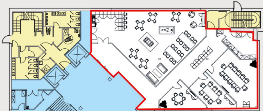
BUILDING BREAK OUT / MEETING ROOM WING