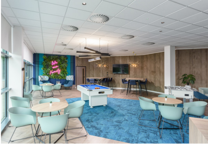
Communal Break Out Area