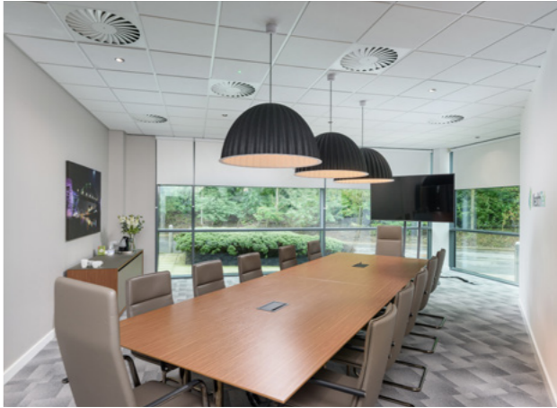
Break Out / Meeting Room Wing